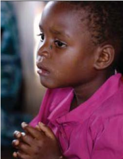
Nurturing Nkhoma's Orphans

Support for Nkhoma's orphans and vulnerable children come from two funding sources: child sponsorship and special projects, including the Nkhoma Orphans and Vulnerable Children project. Child sponsorship funds provide primarily for the children who are supported by generous U.S. sponsors. Funds provided through the Nkhoma Orphans and Vulnerable Children project help support local orphans and vulnerable children who are not sponsored. Together these projects supply the essentials to all Nkhoma orphans and vulnerable children in need.