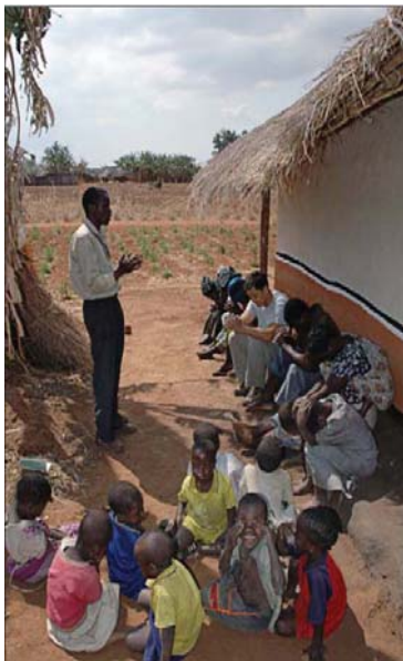
Nkhoma Area Development Program is 43 miles southeast of Lilongwe, Malawi's capital. The area's 25,000 people live in 150 villages and 3,722 households. Of these, 5,000 children are in critical need of assistance because their parents are ill or have died from causes pointing to AIDS. Here community members pray before a dental clinic.

Nutrition is a major issue among Nkhoma's orphans and other children made vulnerable because of HIV or AIDS, but it is not the only challenge. In families where one or both parents have died, or parents are